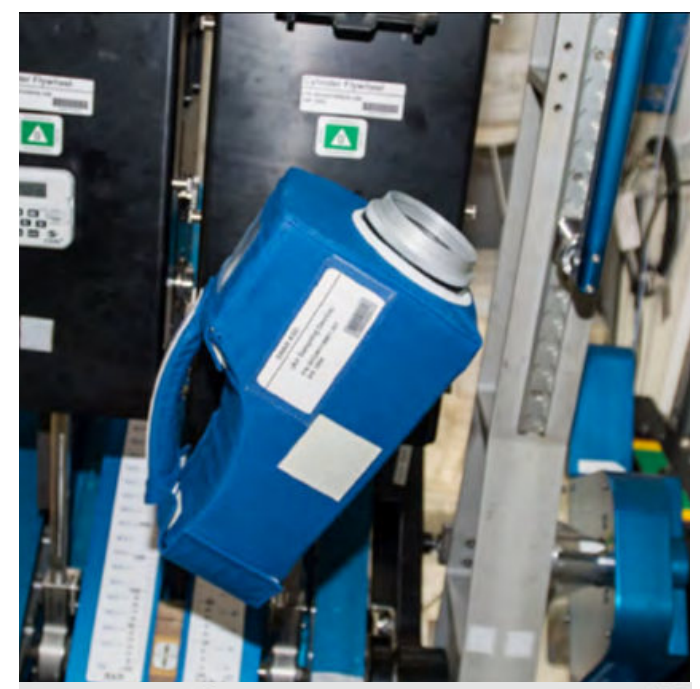
Microbial Observatory-1 aboard the ISS NASA ID: iss043e198394

These effects of altered gravity on living organisms are of great interest to the scientific and academic fraternity, which not only addresses the fundamental biological processes that are affected by gravity but also addresses various challenges and develops strategies for ensuring safe long-duration space travel for astronauts.